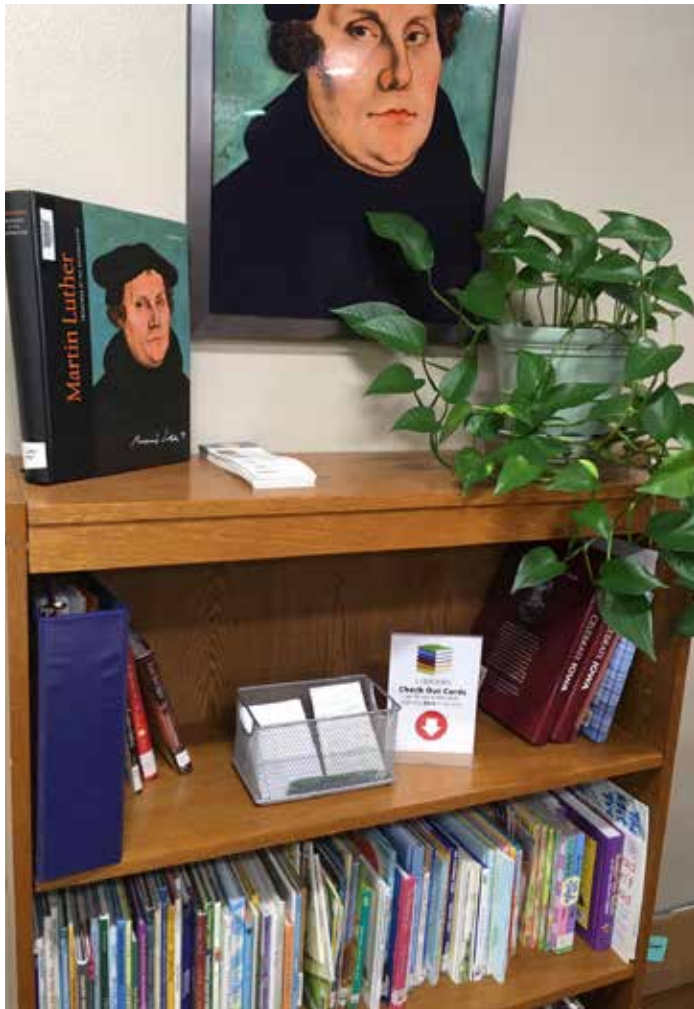
Library Check-out station

Periodicals are in racks behind the information center, including "The Christian Century," "Sojourners," and "Gather" magazines. "Ranger Rick" is available for the children.