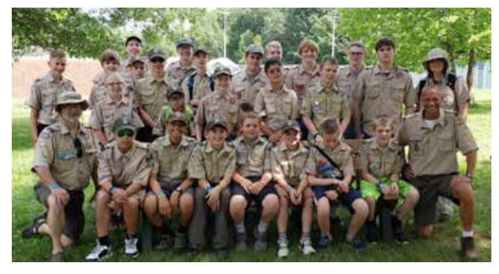
Troop 140 Scouts and Scouters at Camp Mitigwa in July, 2019.

Troop 140 is grateful for the support of Bethesda Lutheran Church in helping our Scouts become men.