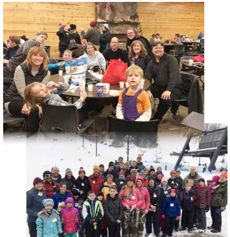
Bethesda had a SUPER SUNDAY blast at Seven Oaks on February 10! Winter fun was had both outdoors and indoors.

You are forgiven. You are welcomed into eternal life. You are covered by what God has done for you already! When you believe this to be true for you, you can't help but believe it to be true for the rest of God's creation. Your actions can now stem from the love God has shown you, not fear. It is a struggle, to be sure. Because who is God, that God would do such a wonderful thing?