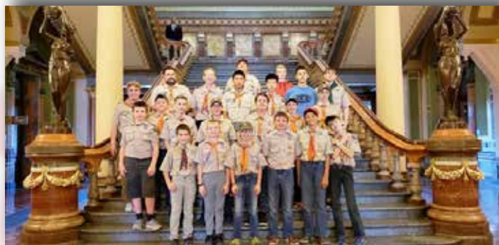
Troop 140 Scouts at the State Capitol last October as they completed some requirements for the Citizenship in the Nation merit badge.

On Sunday, February 10, we celebrated Scout Sunday at Bethesda. It is a day to recognize the contribution of youth people and adults to Scouting.