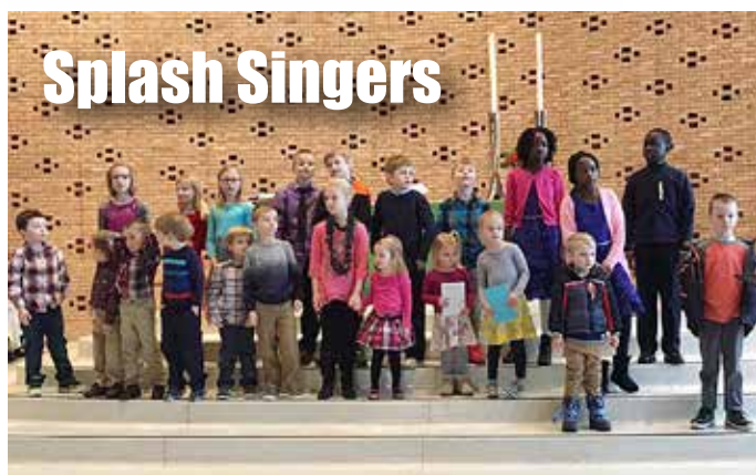
On January 27 the SPLASH Singers presented "Deep and Wide" during worship