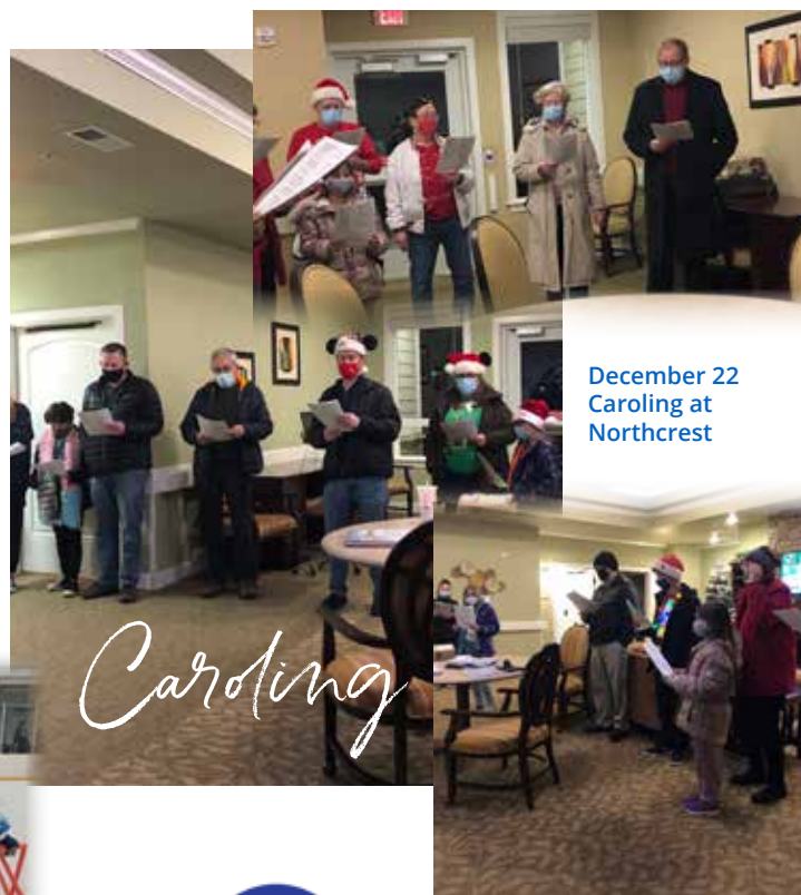
December 22 Caroling at Northcrest