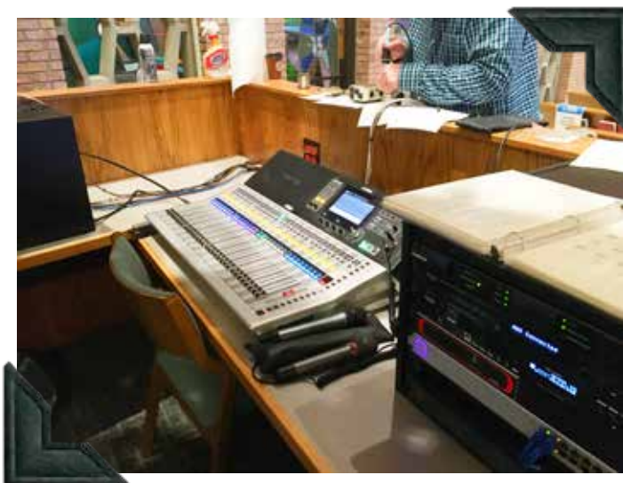
The sanctuary sound booth and projector is nearing completion.

Starting with Holy Week, the Council increased the acceptable attendance to 37 family units with 6 people being the maximum to a group. We started with a total of 21 people (adults and children) on Feb 7th, 55 people for Easter April 2, 39 people on April 11th, 50 people on April 25 and 65 people on May 2nd. Slowly people are coming to church as they feel comfortable getting out and nearer people not in their "pod."