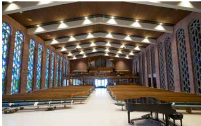
The Sanctuary is ready for limited seating—for the first time since March of 2020.