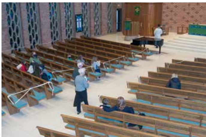
People! In the Church! Worshipping! On a Sunday!

It was exciting this morning to start the long road back to "normal" as there were 16 adults (including the Pastors and sound and video crew) and five children worshipping together in the Sanctuary while the rest of us continued to worship online. After everyone gets both vaccination shots and the pandemic is under control, we will all be glad to get back to worshipping together as a Bethesda Family.