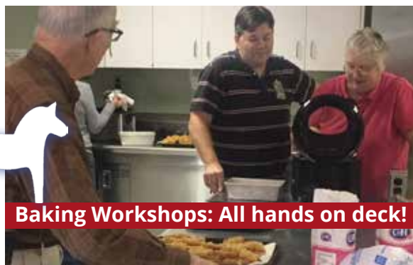
Baking Workshops: All hands on deck!