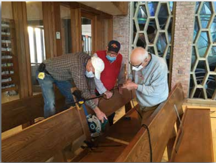
Members of the Facilities Ministry Team remove several pews in preparation for construction of a new Sound Booth.